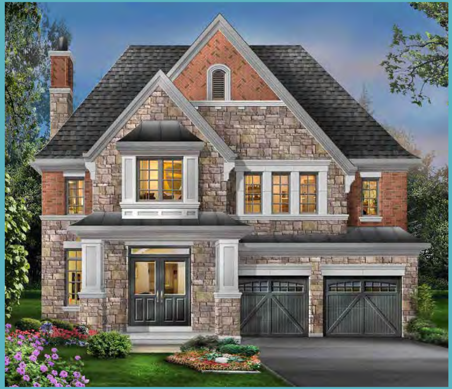
ELEVATION A • 4,322 SQ.FT.*