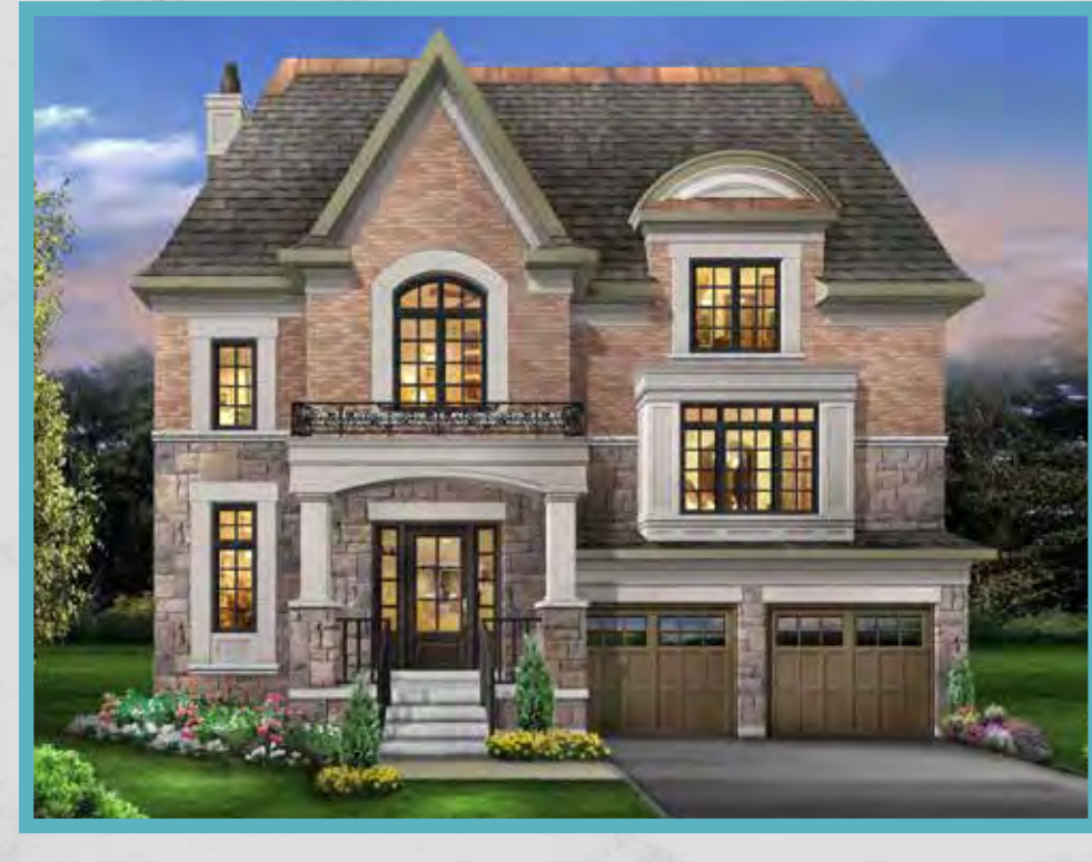
ELEVATION B • 4,538 SQ.FT.*